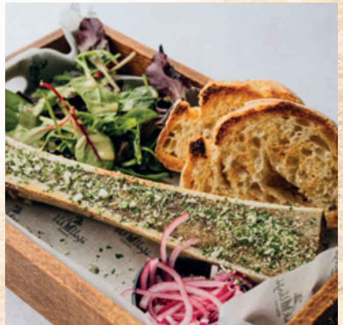
Oven-baked bone marrow with garlic toast and pickled red onion