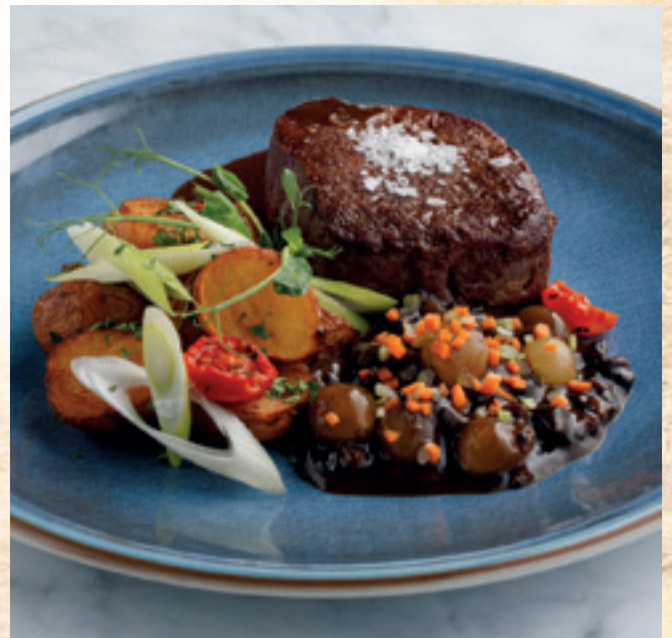
Beef tenderloin steak with bourguignon sauce and Parmesan oven-baked potato