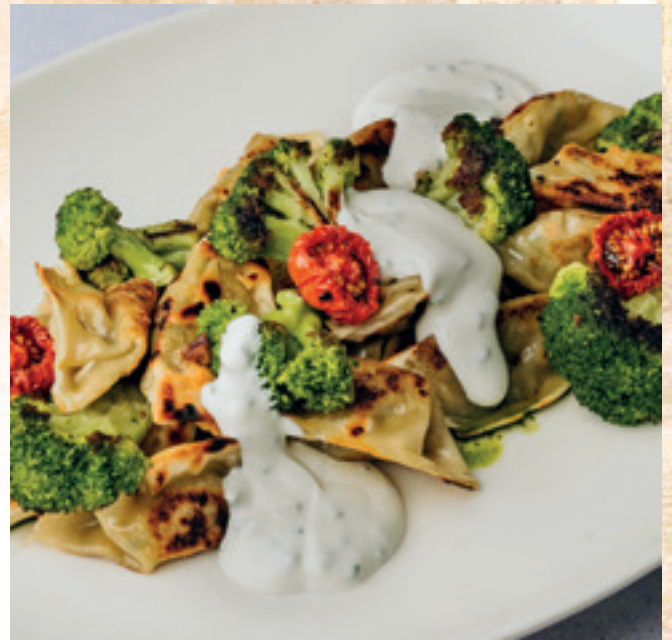
Vegetable stuffed Pelmenyi with chive sour cream and roasted broccoli