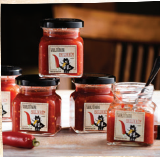
VarjúPapa chili cream