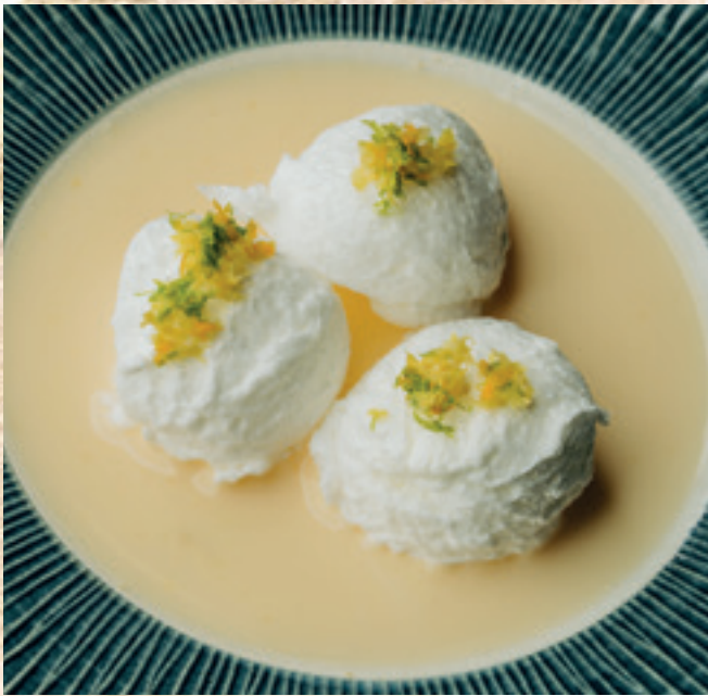
Floating island with citrus flavoured whipped egg white bal