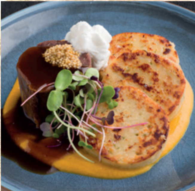
Confited beef chuck "Vadas" style with bread dumpling and sour cream