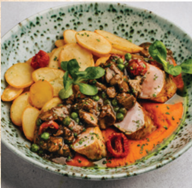
Aged ham-wrapped tenderloin with letcho cream, green pea duck liver ragout and crispy potato rösti or chips