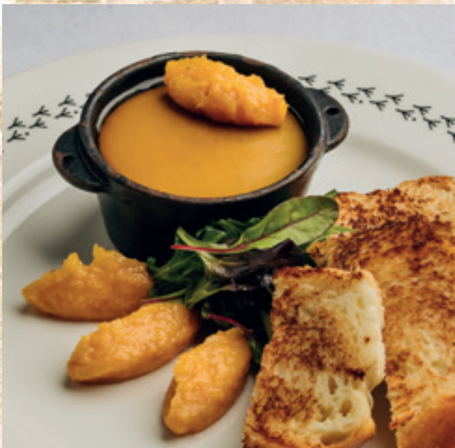
Duck liver mousse with elderflower jelly, apricot chutney and toasted milkloaf