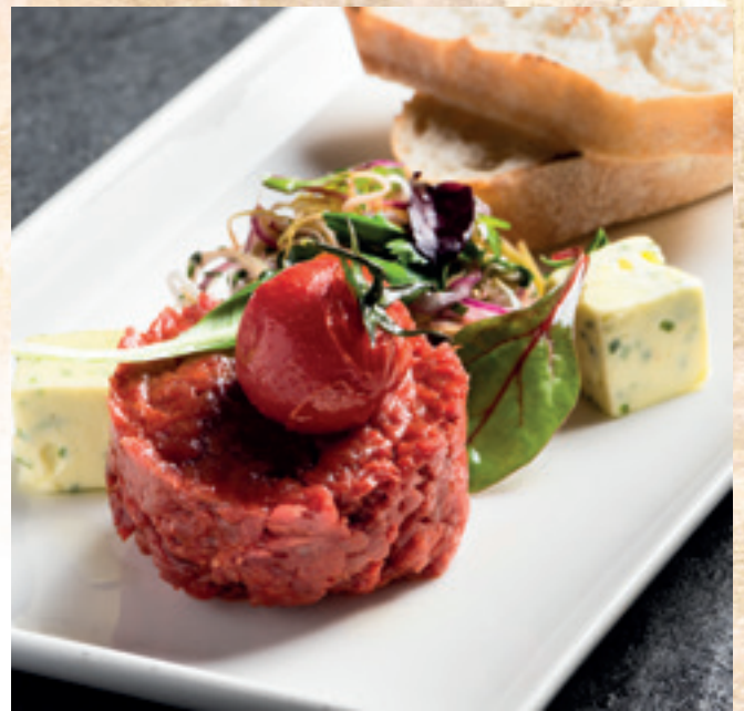
VarjúPapa's beefsteak tartare with fresh vegetables and leavened bread