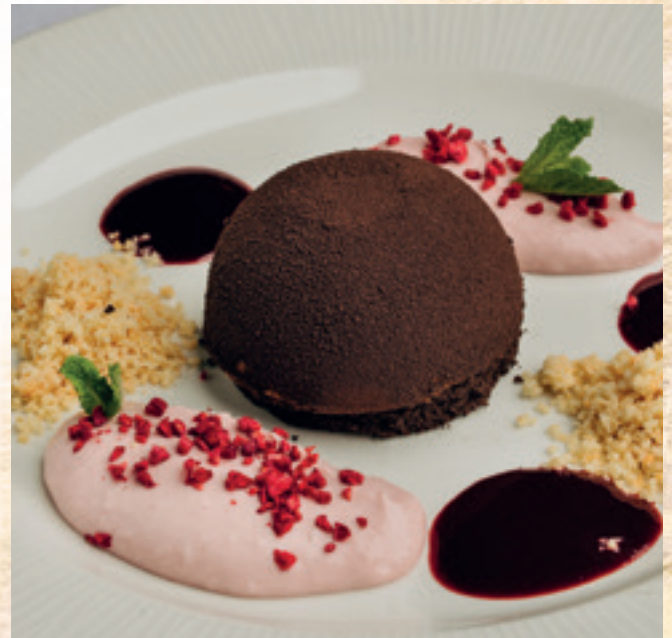
Raspberry dark chocolate mousse with blackberry coulis and almond crumble