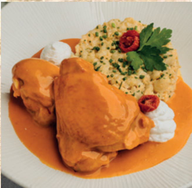
Chicken paprikash with egg dumplings, sour cream foam and vinegar-dressed lettuce hearts