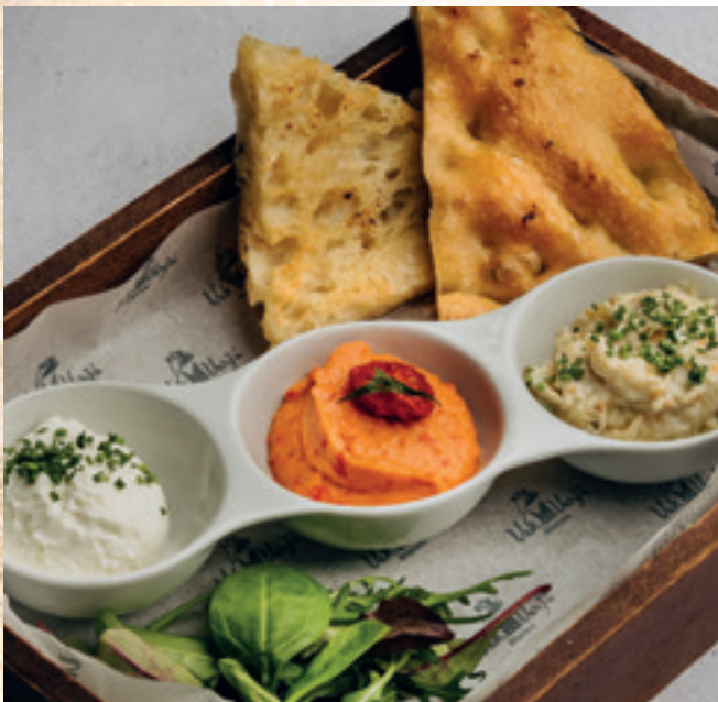
VakVarjú's dip selection with home-made focaccia: Transylvanian eggplant cream, kápia pepper hummus, creamy goat cheese