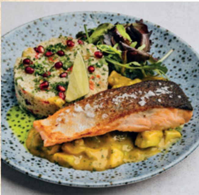
Grilled salmon fillet with pomegranate couscous salad and avocado mango salsa