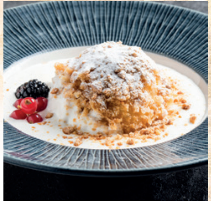
Cottage cheese dumpling with macaroon flavoured sour cream