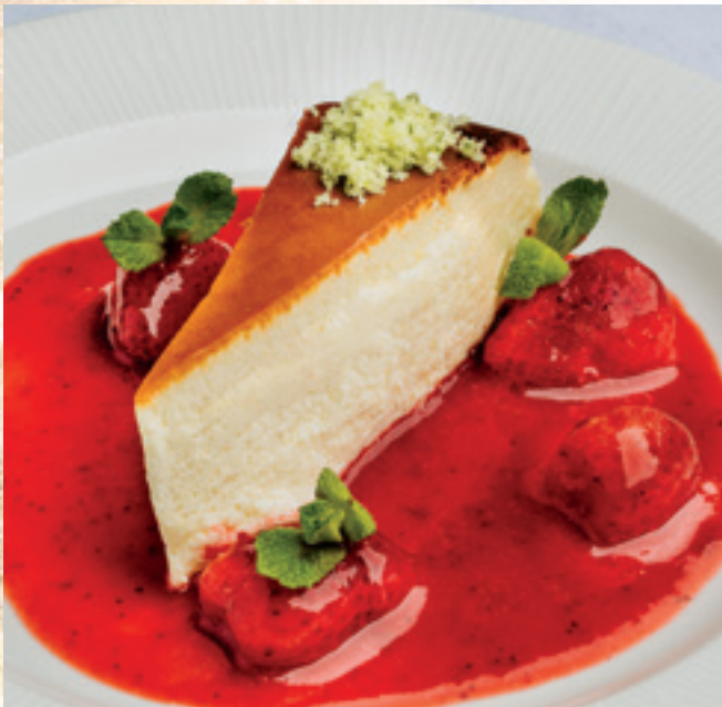
Basque cheesecake with strawberry ragout