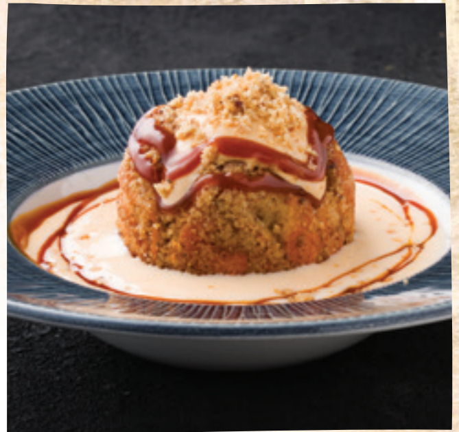
“Golden dumplings”: sweet baked dough covered with butter, sugar, and ground walnuts, served with vanilla custard