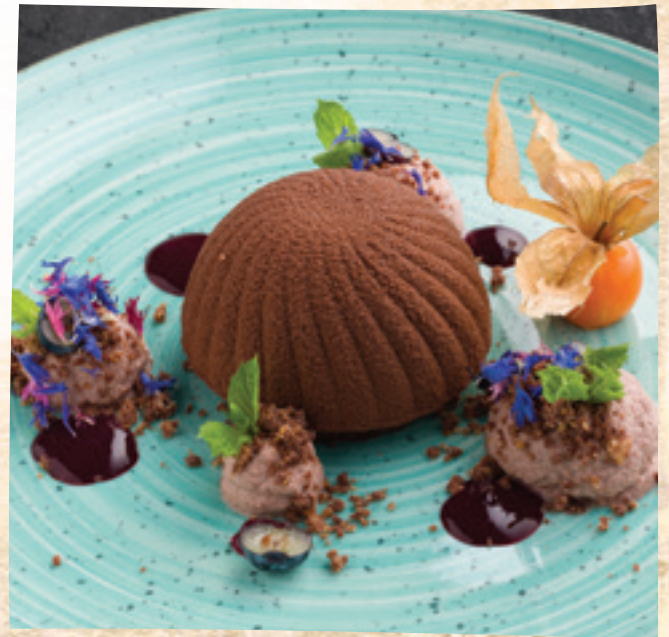
Mandarin dark chocolate mousse with blackberry coulis and almond crumble