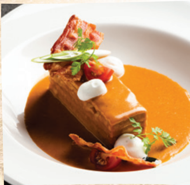
Stuffed crepe "Hortobágy" style