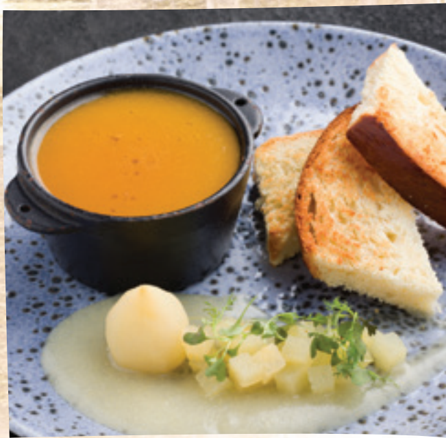
Duck liver mousse with Tokaji wine-jelly, pear textures and milkloaf