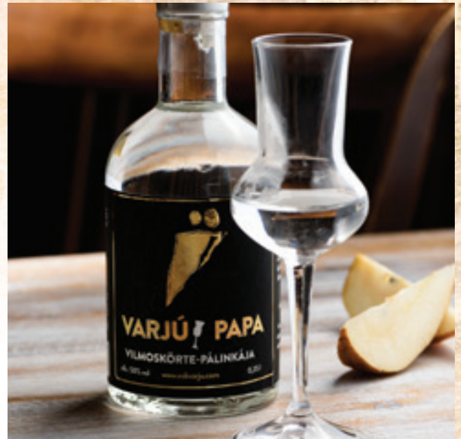
VarjúPapa's palinka 7 350 HUF/bottle/take away