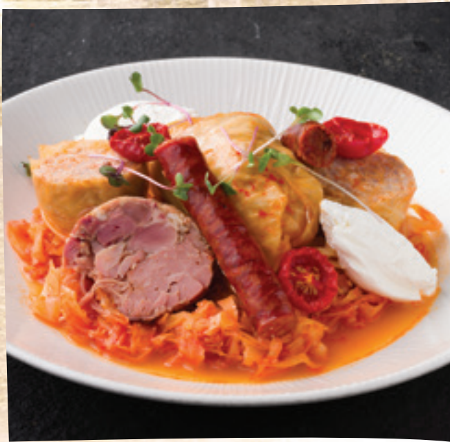
Stuffed cabbage with smoked pork knuckle, duck sausage and sourdough bread