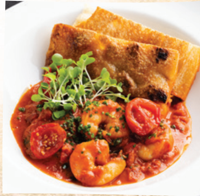
Tiger prawns in spinach-tomato sauce served with focaccia