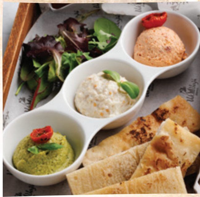
VakVarju's dip selection with home-made focaccia: Transylvanian eggplant cream, goat cheese cream with dried tomato, hummus with basil pesto