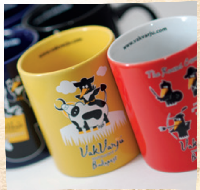
VakVarjú's cup 2 890 HUF/piece