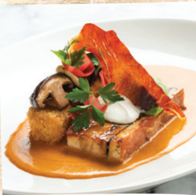
Pressed chicken "Bakony" style with roasted shiitake mushrooms and ewe's cheesy potato noodles in crispy coat