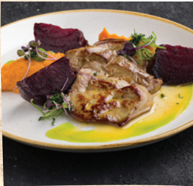
Roasted duck liver with sweet potato purée and roasted balsamic beetroot