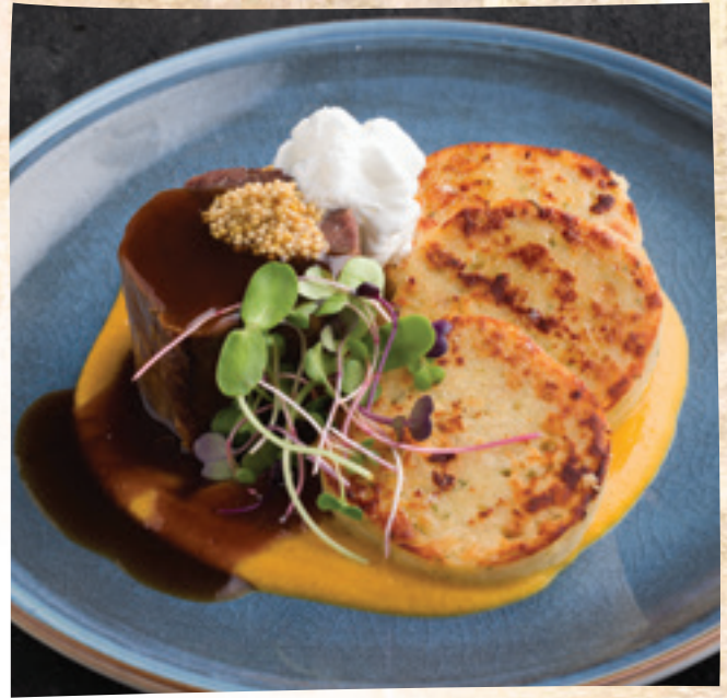
Confited beef chuck "Vadas" style with bread dumpling and sour cream