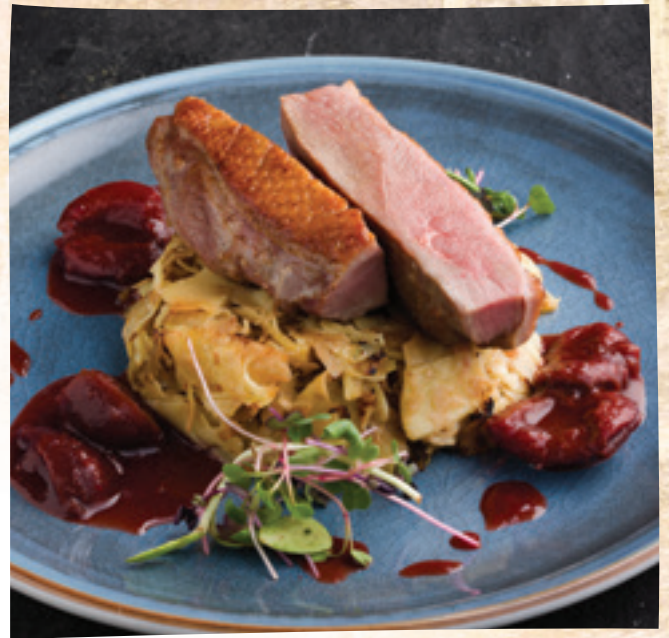
Rosé duck breast with cabbage pasta and acacia honey cardamom plum ragout