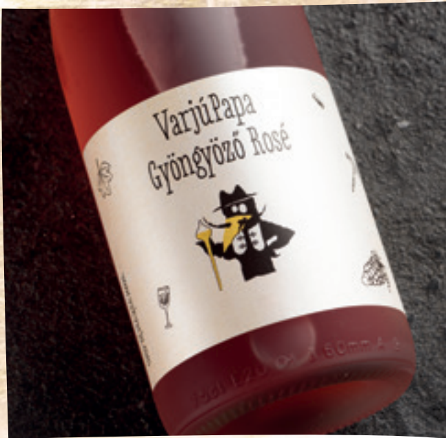
VarjúPapa's rosé wine 4 490 HUF/bottle/take away