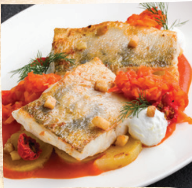
Pike perch fillet roasted on the skin "Rác style" with ratatouille and roasted potatoes