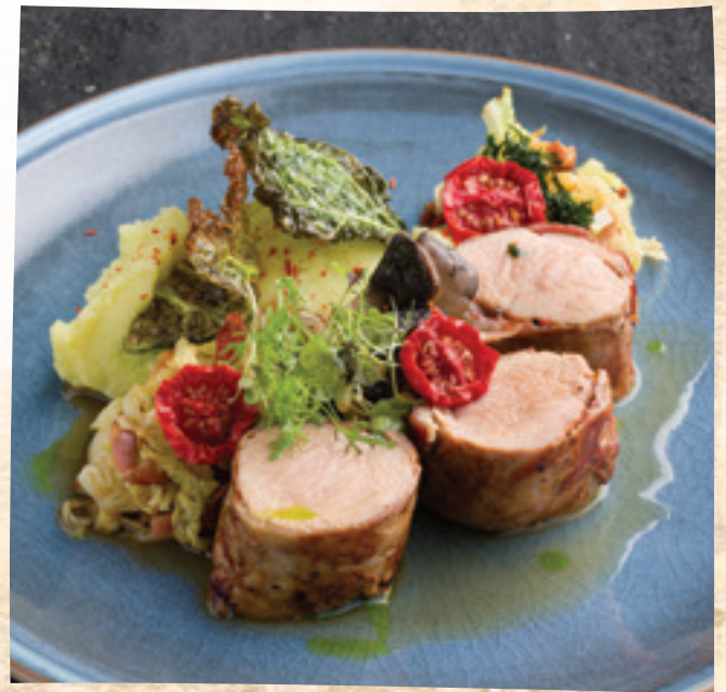
Pork tenderloin rolled with aged ham, mashed potato with kale and sautéed shiitake mushrooms