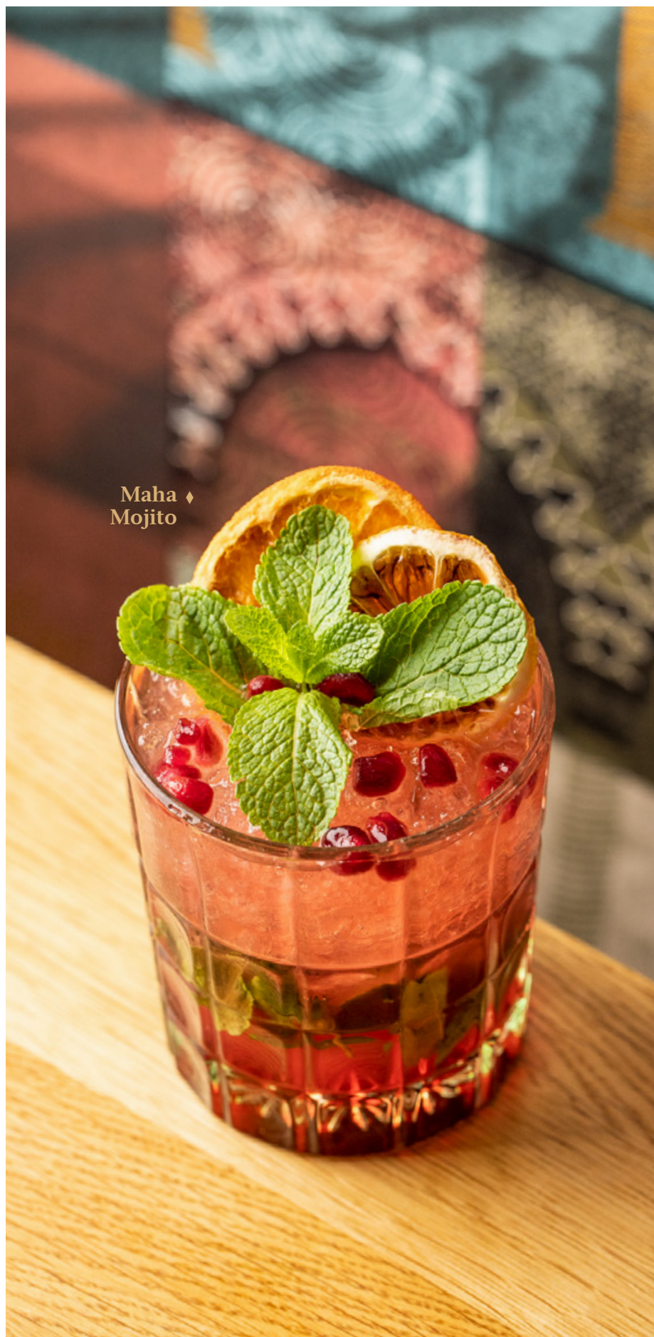
Maha ♦ Mojito